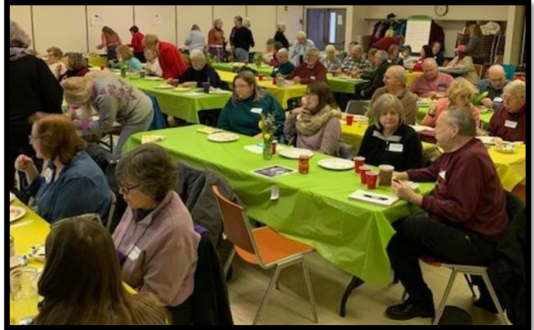
CHIS members enjoying the Doldrums Party held in February 2020.

Meetings are usually held on the third Sunday of the month from September to April at the East Greenbush Community Library in East Greenbush, New York. Events include meetings, a perennial sale, flower show and barbeque, an iris rhizome sale and, with enough interest, a bus trip. Please contact one of the officers if you would like to join us.