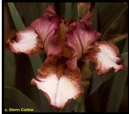
BB 'Brown Berry' (Willott, 1987)