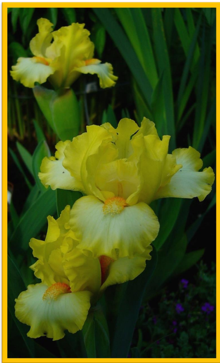
'Blissful' (P. Black, 2016)