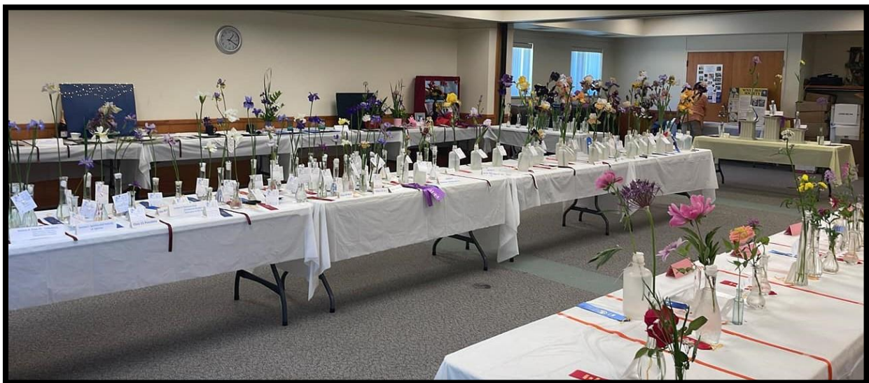
A Room with an Iris View!