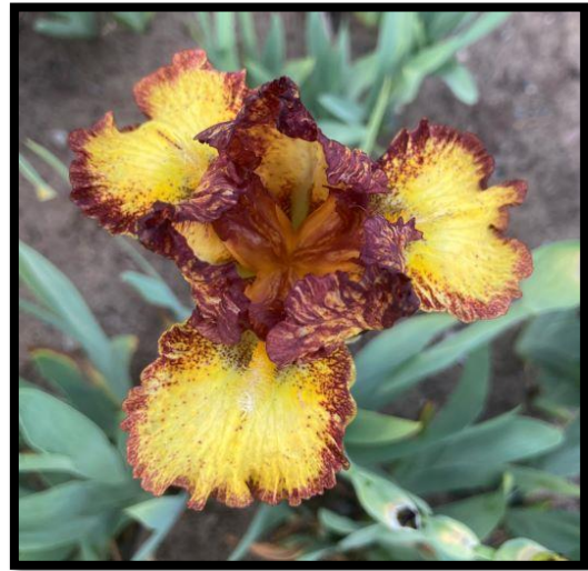
IB 'Red Hot Chili' (Sutton, 2008)

Becoming an accredited AIS judge is a great way to learn about the characteristics of a good garden iris. It's easy and fun. For more details on how to become a judge use this link to go to the judges page on the AIS website. Judges – American Iris Society (irises.org) .