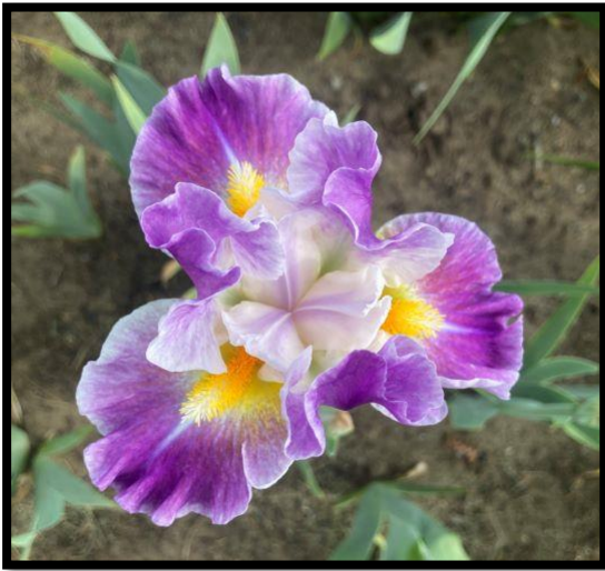
IB 'Backlit Beauty' (Tasco, 2010)