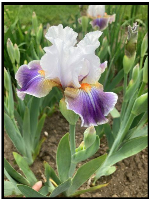
IB 'Dazzling' (Black, 2008)

My husband and I live in the Town of Greece, a suburb of Rochester. Our house sits on an average-sized lot with three mature trees in the front yard - a red maple, a pin oak, and a pink dogwood. In the backyard is a very old crab-apple tree, a shed, a vegetable garden, and some raspberry bushes. I grow spring and summer bulbs (including I. reticulata and Dutch Iris), various perennials and wildflowers, and over 190 varieties of irises and beardless iris seedlings. The garden areas are located along one fence line, beside three foundation walls, and in two modest gardens in the midst of the lawn. All garden areas are maintained with concrete block or black plastic landscape edging.